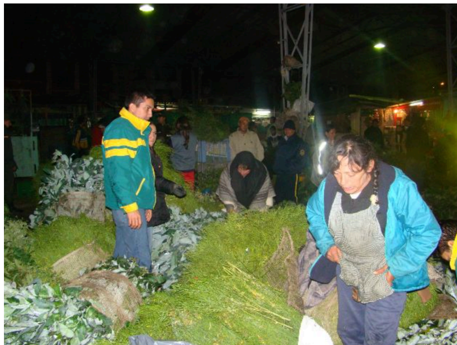
Fuera del edificio se encuentran manojos de hierbas variadas

Es noche cerrada en Bogotá y las calles están desiertas, menos en la plaza Samper Mendoza.